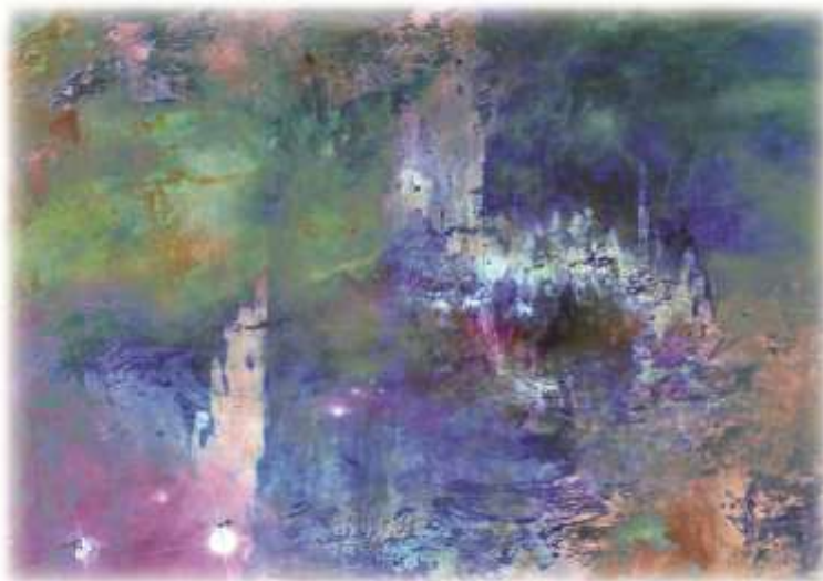
City of Light

Aside from attendance at each gathering and participation, your primary commitment is to yourself. Your willingness to embark upon this journey will reap the highest reward if you dedicate this time in your life to embrace all that is light and true within you; engaging with the material offered throughout the year, as well as the group experience, carries with it this ultimate potential.