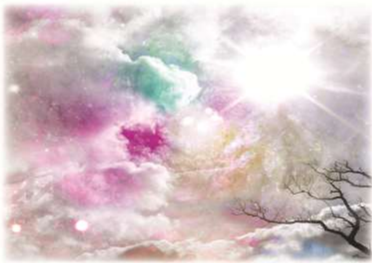
Bridge Across Forever

Visions of Reality: Art of Synthesis is the culmination of a life's journey, each step being taken in apparent darkness until, at last, the light shines through to bring clarity and cohesion to all the disparate 'threads'. Its purpose, therefore, is to provide the right conditions so the flower of your own understanding may illuminate your path; that your strengths,