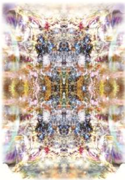
Festival of Light